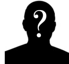
Sealed Indictment Suspect Charges: Sealed Indictment